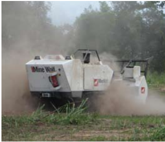
Mini MineWolf in Colombia

On 4 th December 2009 Colombia successfully concluded its hosting of the Cartagena Summit on a Mine Free World. As confirmed at the summit, Colombia is considered to be the country most affected by landmines and explosive remnants of war (ERW) in the Americas and the casualty rate from mines and ERW is one of the highest in the world. The improved security situation means that mine clearance efforts will gain momentum. Whilst the exact extent of the contamination is still unknown, Colombia can now use a Mini MineWolf machine to speed up the process of releasing land back to the affected communities.