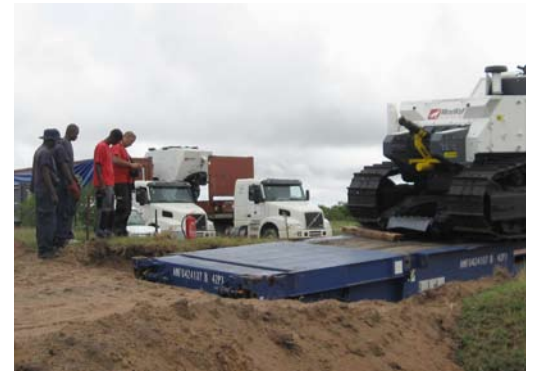
MineWolf being deployed to the field for training

personnel (AP) and anti-tank (AT) mines. In accordance with the contract, twelve mechanics from Angola undertook training at the manufacturer's facilities in Germany during July 2009. The first machines arrived in country at the beginning of November and training continued in real life conditions. MineWolf Systems will maintain a presence in Angola for