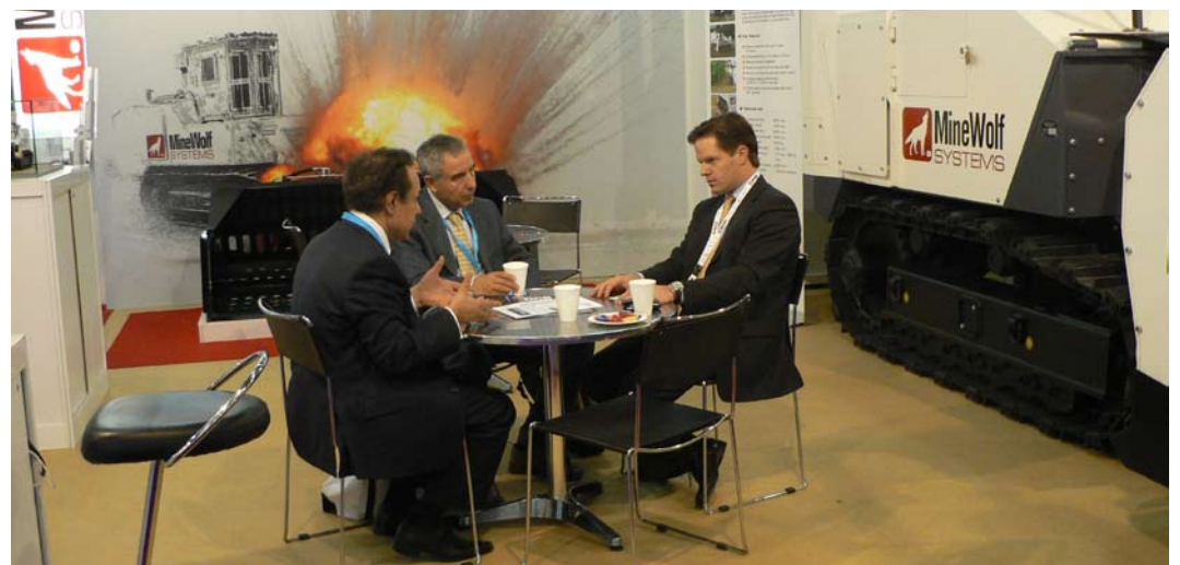
MineWolf Systems' stand at DSEi

MineWolf Systems will exhibit again during Eurosatory in Paris from 14 th –18 th June, 2010.