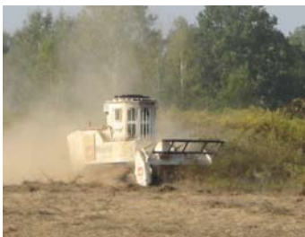
MineWolf working in Bosnia-Herzegovina

During the 2009 demining season in Bosnia and Herzegovina, Norwegian People's Aid (NPA) cleared almost two million square metres of land using MineWolf machines. The precise figure of 1,916,450 m 2 of land mechanically prepared between March and November showed that last season was NPA's most productive so far in Bosnia-Herzegovina.