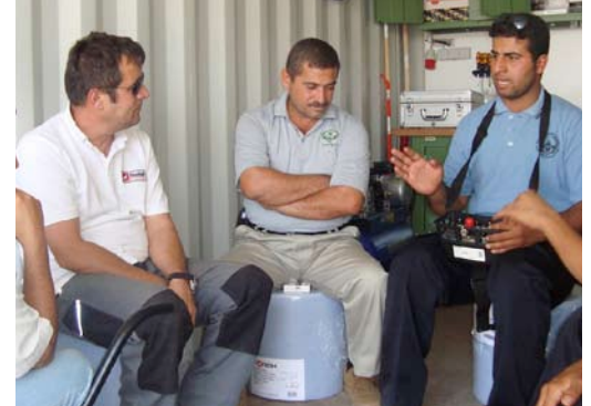
Instructor explaining the use of the remote control

redevelopment, once the training is complete and the SOPs are fine tuned.