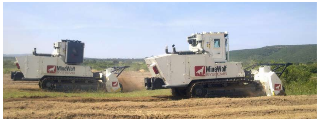
Operator training in Angola

a period of nine months to ensure that INAD (Instituto Nacional de Desminado) personnel will be fully capable of operating the equipment. The first machines will be deployed to Angola's Southern provinces in January 2010 to free the country's most heavily affected areas of landmines.