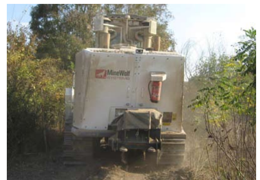
MineWolf clearing in heavy vegetation

In August, NPA hosted representatives of the German Ministry of Foreign Affairs, from the Department for Humanitarian Aid and Humanitarian Demining and representatives of Brcko District Government at the Brvnik site to see the machines in action. The GFFO is one of the major donors for Norwegian People's Aid humanitarian demining projects in Bosnia and Herzegovina and thanks to joint efforts the cooperation will continue in future.