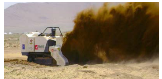
Mini MineWolf working in sandy terrain in Afghanistan

We would like to thank DDG for the content of this article.