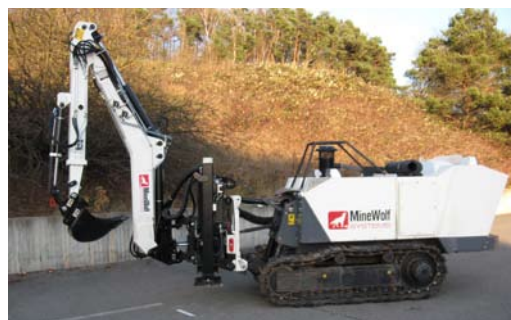
Mini MineWolf with robotic arm and bucket attachment

MineWolf Systems' philosophy to product development is to enhance the functionality of its