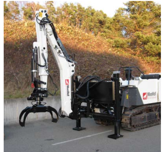
Mini MineWolf with robotic arm and gripper attachment

MineWolf Systems aims to work together with its customers to develop applications and offer mechanical solutions for dealing with explosive devices on a daily basis.