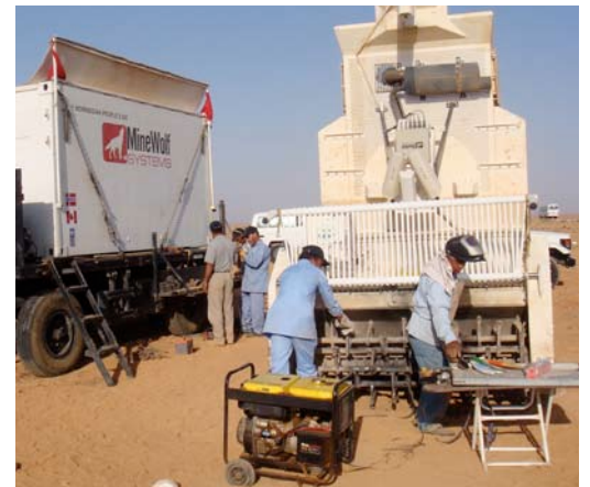
Mini MineWolf undergoing maintenance

The ground proved to be very difficult in the first ten kilometres of clearance, with buried rocks in the minefields both the tillers and the flail suffered and both machines required a high amount of maintenance which made progress slow. The teams are now working in the western part of the task site where the ground is much better suited to mechanical treatment and NPA estimate that the task will be completed within the next two years. To achieve this, NPA are hoping to secure donor funds to purchase a large MineWolf machine to speed up the verification process.