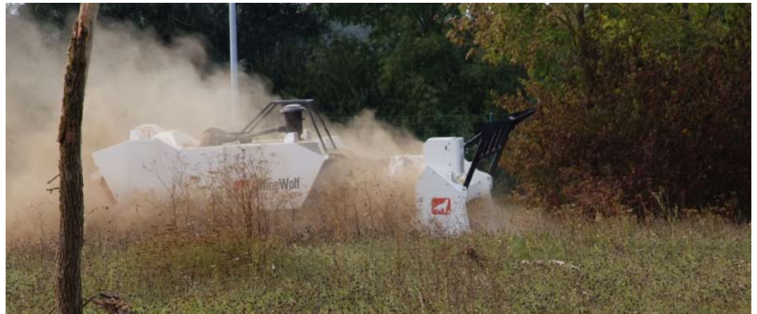
Presenting the Mini MineWolf to the German Army Engineers

MineWolf Systems presented its Mini MineWolf in conjunction with different demining services and the mine detection dog platoon. Those attending were impressed by the superior performance and clearance rate of the Mini MineWolf and in particular praised the fact that operators are safe due their distance from the machine while operated remote controlled. MineWolf Systems was thanked with an official certificate for the continuous support by the Commanding General of German Engineer Corps and Commander Engineering school, Brigadier-General Krippel.