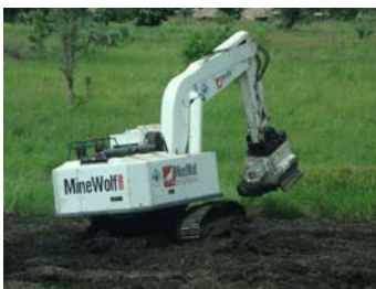
MineWolf Bagger working in Sudan

MineWolf Systems actively promotes the concept of land release using a mechanical approach. Land release was chosen as the main theme for the 2009 MineWolf Mechanical Operations Workshop to stimulate discussion on the concept and further best practice. At the workshop, one of MineWolf's partners, Norwegian People's Aid (NPA) chose to elaborate on how they use MineWolf machines for the release of land in Southern Sudan. To