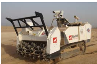
Mini MineWolf with camera system

After a long wait for Ronco's newly acquired Mini MineWolf to cross the border from Kuwait, training is finally underway for operators & mechanics from IMCO – the 'Iraq Mine & UXO Clearance Organisation' set up by Ronco as part of their Weapons Removal & Abatement project in Az Zubayer, Basrah. The Mini MineWolf team consists of a team leader, three operators, a mechanic and a