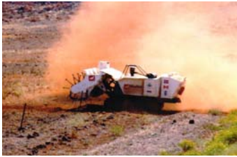
Mini MineWolf with flail operating in Jordan

The last remaining minefield in Jordan is currently being cleared by Norwegian People's Aid (NPA) along the Syrian border to the North of the country. It consists of approximately 100 km of pattern laid military minefields – established in the 1970's.