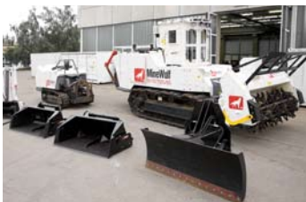
MineWolf and Mini MineWolf with a range of attachments