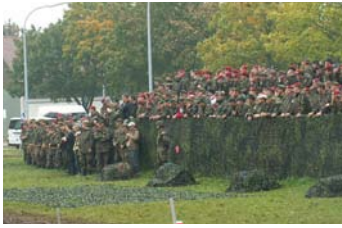
Spectators at the German Army Engineering School