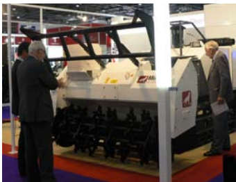
Mini Minewolf with tiller displayed at DSEi

From 8 th –11 th September 2009, MineWolf Systems exhibited at one of the world's largest fully integrated defence and security exhibitions – DSEi 2009 in London. The exhibition was attended by a large number of official delegations from all around the world. Over four packed business days attendees from the defence, security and military aerospace community experienced first-hand the latest land, air and sea capabilities of more than 1,350 companies from 40 countries.