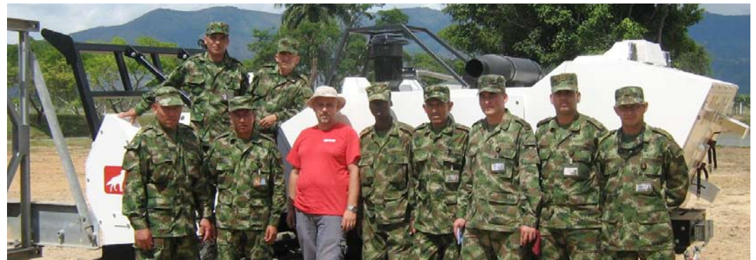
Colombian trainees undergoing training course

Colombia is investing in its own infrastructure to address the mine problem and, following the success of the summit is looking to further develop its own capacity to achieve the goal to become mine-free.