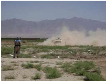
Mini MineWolf operating in dusty environment in Afghanistan

The Danish Demining Group (DDG) received their first Mini MineWolf in 2008 and the operation team was trained by MineWolf Systems during April and May. Its first operation took place in Bagram in June 2008, and the machine and operators were accredited on June 4 th by the UN Mine Action Centre in Afghanistan.