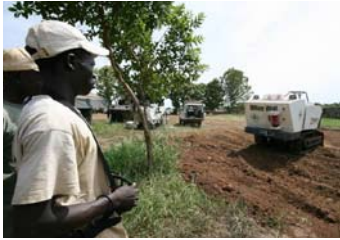
Operator handling the Mini MineWolf remote controlled

2005, the MineWolf Bagger since August 2008 and the Mini MineWolf since May 2009. Rather than focus primarily on mine clearance, NPA uses the concept of land release, which focuses on releasing land back to the community as soon as possible, through both non technical and technical processes. Typically a suspected hazardous area (SHA) is released by either general survey (or a re-assessment of existing survey information), by technical survey or by full clearance. Clearance is obviously the most expensive option and so the more land that can be released through general and technical surveys the better.