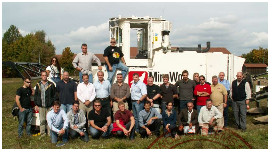
Participants at the 2009 Mechanical Operations Workshop